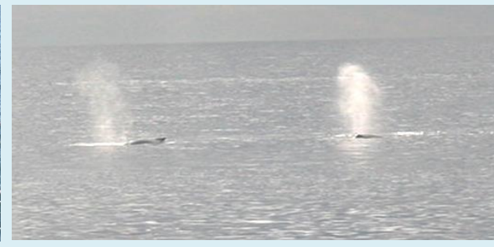
BLOWS A whale just surfaced for a breath