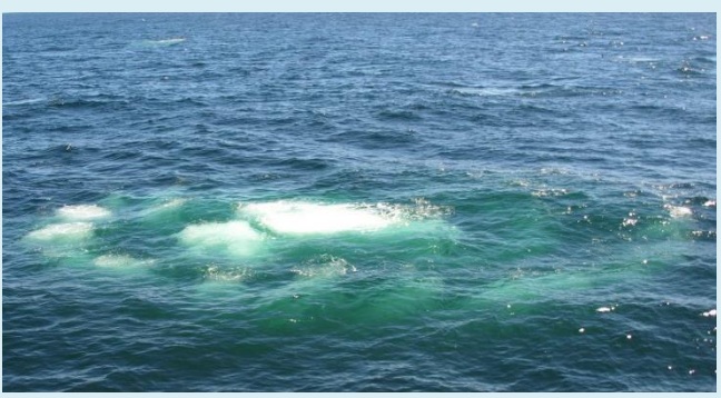
BUBBLES Feeding whales are nearby (also look for lots of birds and fish)