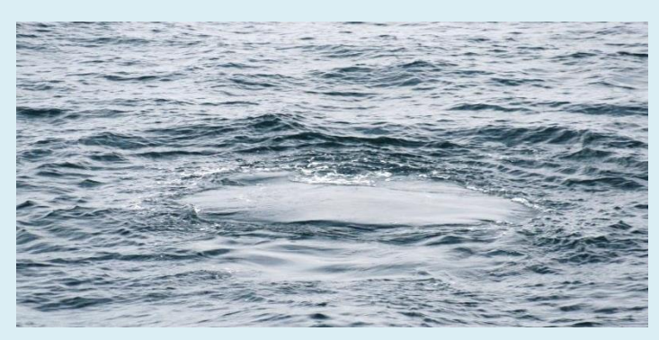
FLUKE PRINTS (flat patch of water) A whale just dove below the surface